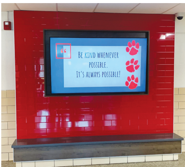
😤 ELLIS ELEMENTARY, PLATTSBURG MIDDLE SCHOOL & HIGH SCHOOL UPGRADES